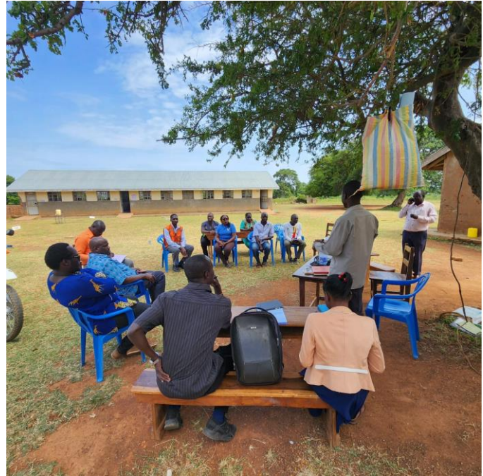
Figure I & II: Meeting between the Asst. Commissioner Public Health and District health , education and engineering leadership and engagement with school management committee at one of the schools